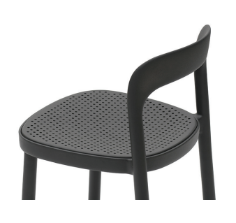
Ebisu Jun Yasumoto