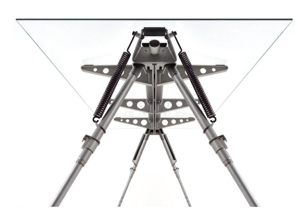
Bipod Table Dai Sugasawa