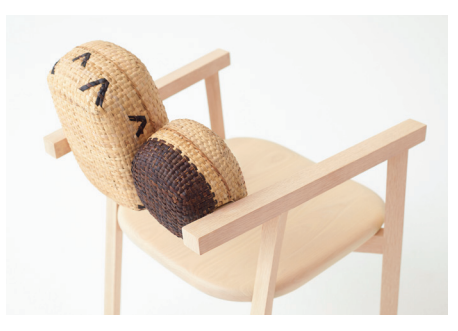
Tokyo Tribal Collection Nendo