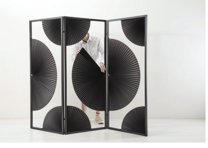
New Old Divider KIMU Design