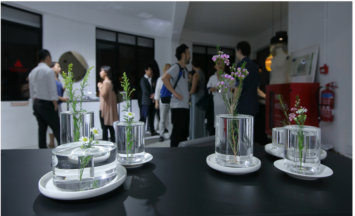
Top: Industry+ Store showcasing pieces of the Industry+ collection alongside art